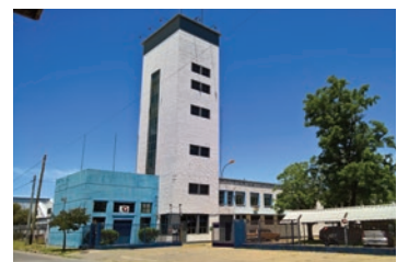
Manufacturing Facility Buenos Aires, Argentina